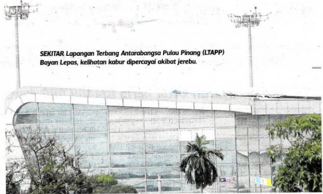
SEKITAR Lapangan Terbang Antarabangsa Pulau Pinang (LTAPP) Bayan Lepas, kelihatan kabur dipercayai akibat jerebu.

Ketika kualiti udara di beberapa kawasan di Sarawak bertambah buruk, udara di Tawau, Sabah mencatatkan bacaan 50 iaitu kualiti yang baik.