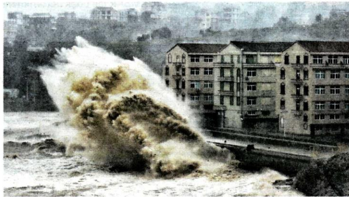
OMBAK menghentam benteng laut di hadapan deretan bangunan di Taizhou, wilayah Zhejiang, Jumaat lalu.

Sekurang-kurangnya 18 daripada yang terbunuh itu disebabkan kejadian tanah runtuh susulan hujan lebat di Wenzhou, lapor media