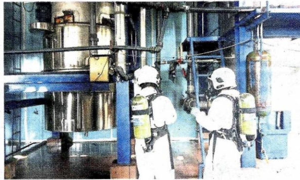
Enforcement failure? The ammonia leak in the ice factory in Shah Alam being checked.

There was the case where two workers died when ammonia leaked at an ice factory in Shah Alam ("Ammonia leak at ice factory: Two dead, 18 hurt", The Star , Aug 13; online at bit.ly/star_leak). An inspection by the Shah Alam City Council (MBSA) found that the premises had a licence to carry out ice processing activities but was not permitted to store haz-