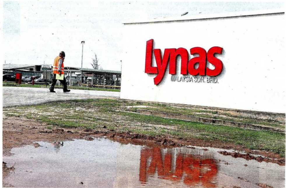
In the advantage: Lynas plant in Gebeng. Being the largest rare earth producer outside China, Lynas Corp and its US$800mil (RM3.35bil) processing plant in Malaysia could reap various benefits should Beijing decides to turn its rare earth exports to the US as a trade weapon.

"Will rare earth become a counter weapon for China to hit back against