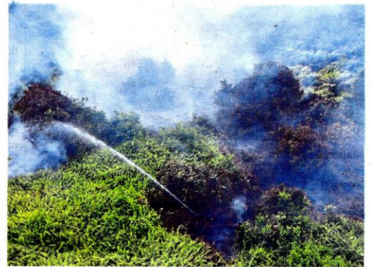
Tough job: Fire and Rescue Department personnel putting out a forest fire in Teluk Sabang, Asajaya, which is about 60km from Kuching.

All other areas in the country recorded moderate API readings.