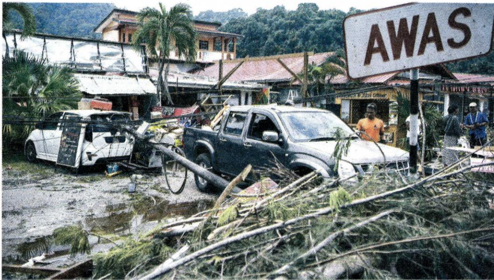
Traders taking stock of the damage caused by typhoon Lekima that hit Pantai Tengah Langkawi three days ago.