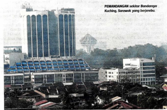
PEMANDANGAN sekitar Bandaraya Kuching, Sarawak yang berjerebu.