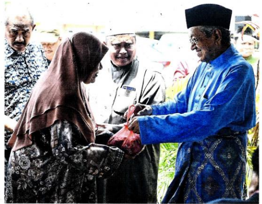
Sharing is caring: Dr M handing out sacrificial meat to the needy after attending the Majlis Ramah Mesra Penduduk Kedawang at Masjid Ar-Rahman Kedawang in Langkawi.

Following this, accompanied by his wife Tun Dr Siti Hasmah Mohammad Ali, Dr Mahathir drove a Lexus SUV to inspect the destruction caused by the storm along Pantai Tengah here.