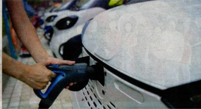
A staff member hooks up a charging cable to an electric vehicle at a charging station in Liuzhou, Guangxi Zhuang Autonomous Region, China.

trying to boost consumption of wide-ranging goods as the world’s No. 2 economy slows further in 2019 amid the trade spat with the United States.