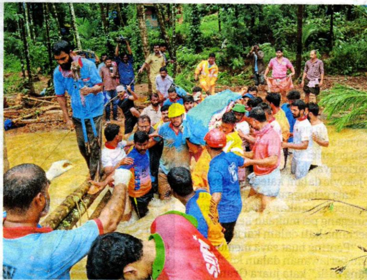
Petugas penyelamat membantu penduduk tempatan menyeberangi kawasan ditakungi air susulan banjir di Kerala, India, kelmarin.