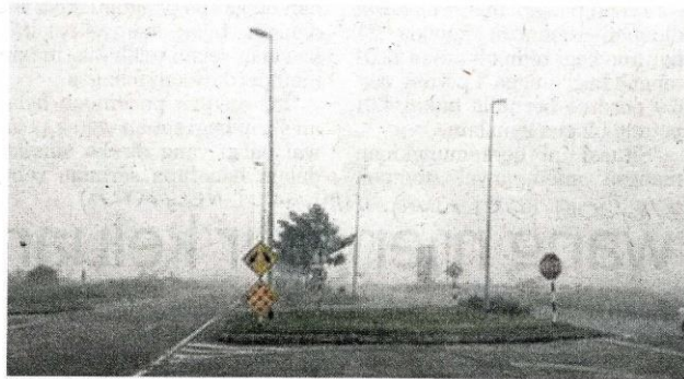
BEBERAPA kawasan di Miri, Sarawak merekodkan kualiti udara berbahaya setakat pukul 6 petang semalam. – Gambar hiasan

Berdasarkan laporan Pusat Meteorologi Khas ASEAN