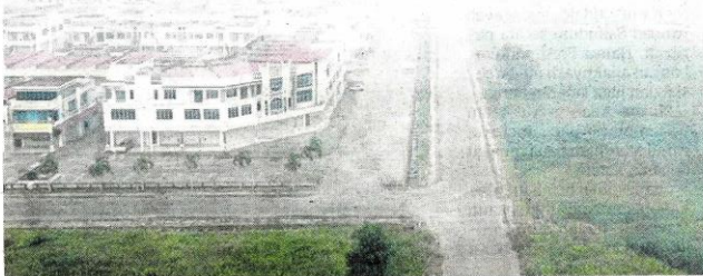
KEADAAN kawasan perumahan di Senadin dan Kuala Baram yang terjejas oleh asap dari tempat kebakaran di sebelah jalan ke Jambatan Asean Miri yang memburukkan lagi keadaan cuaca.

■ Sarawak capai bacaan jerebu tahap merah