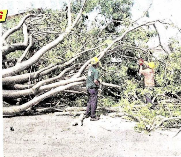
Petugas Majlis Perbandaran Seberang Perai memotong pokok yang menimpa rumah di kawasan Seberang Perai.

"Sehingga kini hanya satu pusat pemindahan dibuka di Tanjung Tokong dan mangsa yang lain ke-